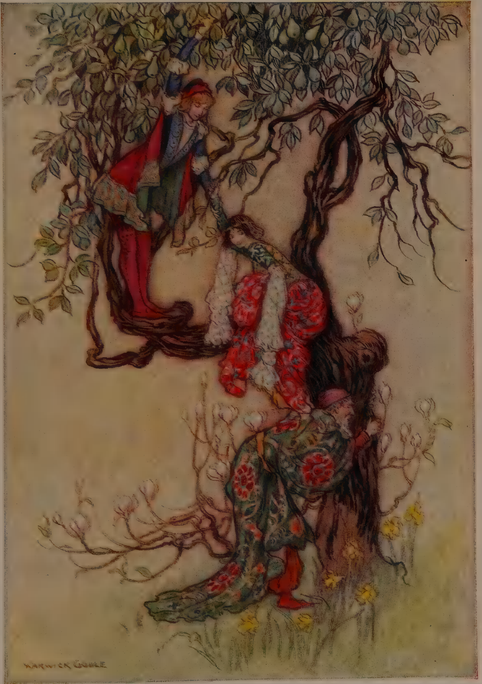
JANUARY HELPING MAY INTO THE TREE